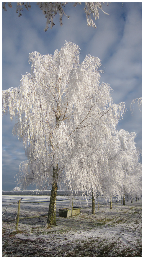
The news in pictures: A frozen tree at the top of Rivey Hill during the 'Beast from the East.' Will things be quite as chilly this winter?