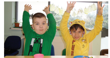
Orca class during children in need

Don't forget to tell our advertisers where you found them!