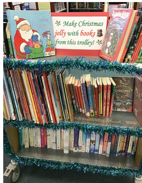
The Library's Jolly Trolley