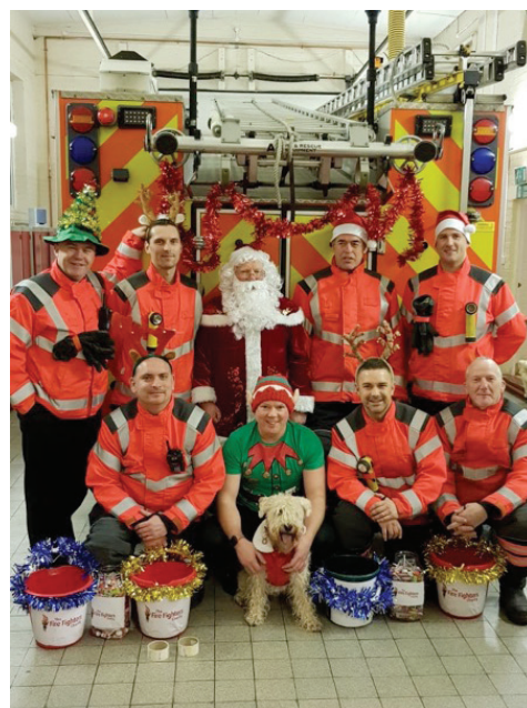
Santa and his assistants pause for a photo